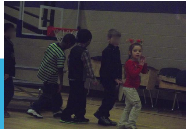
Picture from Valley View Elementary School Winter Concert