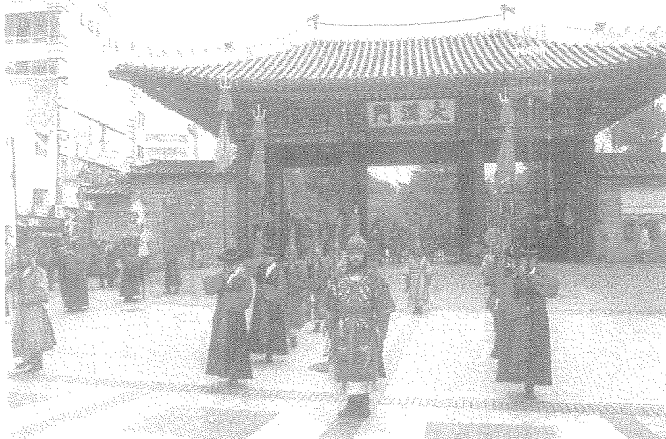
Efforts are being made to have the Korean Ceremonial Royal Guards appear at the 8th Triennial World Hap Ki Do Championships in Battle Creek Aug. 5-8, 2010.